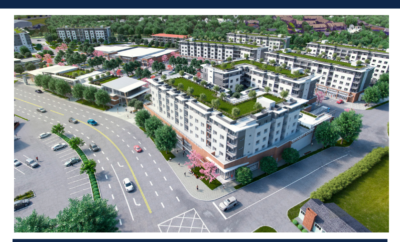
COLWOOD, BC - COLWOOD CITY CENTRE SOOKE ROAD & BELMONT ROAD