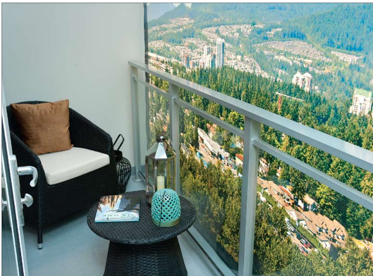
The balconies at Onni's The Shaughnessy on Lions Park allow residents never-before-seen views of Port Coquitlam and beyond.

Homes are priced from $244,900. Visit www.liveatthshaughnessy.com for more information.