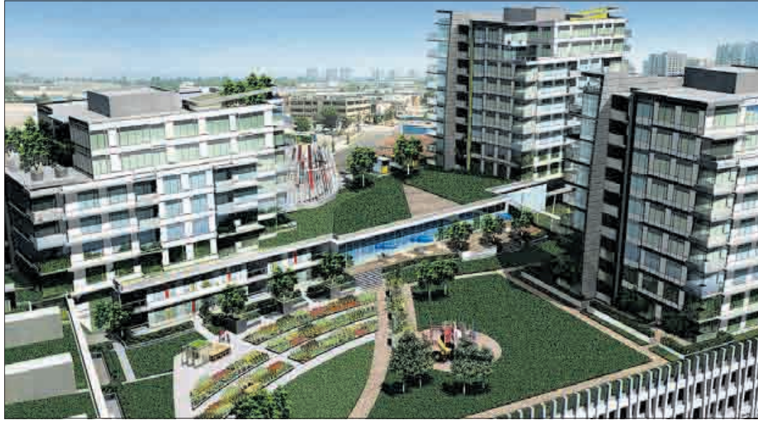
Onni Group's Ora development will feature a landscaped rooftop courtyard and garden plots.

"The majority of the homes in all three phases will have city, water and mountain